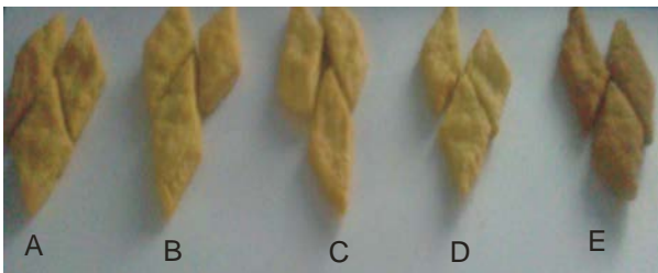
Plate 1. Pictures showing chips samples of wheat-ackee aril flour blend

Appearance or colour by physical examination ranged from 6.30 - 6.88 for chips while taste score ranged from 5.38 - 6.80 in chips. Texture, mouth feel and aroma score ranged from 6.44 - 6.86, 5.72 - 7.02 and 6.30 - 6.70 respectively. Where there was equal mixes of wheat-ackee aril flour (50% WF: 50% AF) resulted in chips scoring lower value for all the sensory attributes tested with the exception of aroma. The control sample score a high value for all the sensory attributes examined with the exception of sample E which score 6.70 for aroma although this was not significantly different from the control.