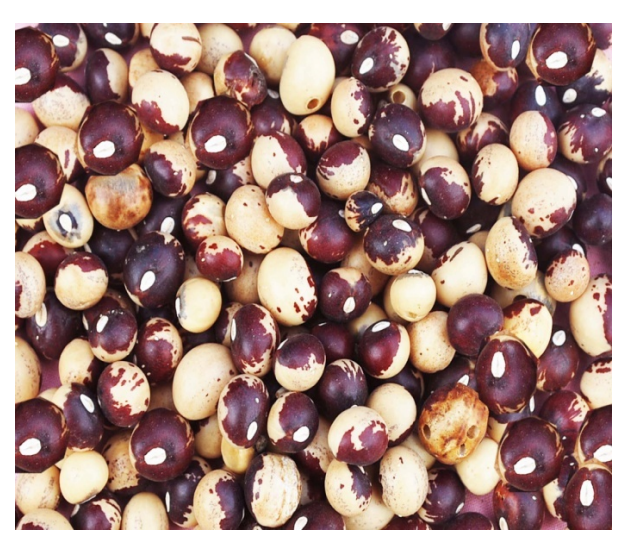
Figure 1b. Vigna subtterranean (Bambara groundnut, mottled coloured special