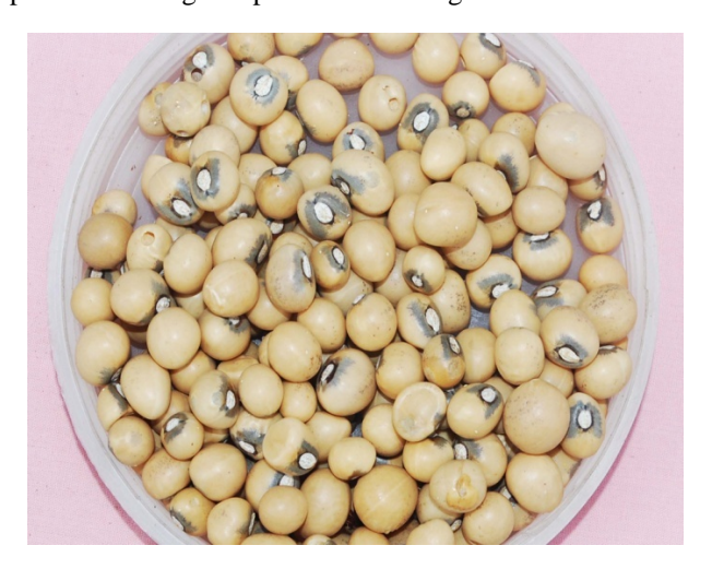
Figure 1a. Vigna subtterranean (Bambara groundnut, Cream coloured specie)

Dried seeds of two species of Vigna subtteranean locally called bambara --- the cream coloured specie, CC (Figure 1a) and the mottled coloured specie, MC (Figure 1b), were obtained from Irawo in Atisbo Local Government Area of Oyo State, Nigeria. Broken and immatured seeds as well as other extraneous materials such as stones and stalks were removed. The seeds were then stored in labelled plastic containers at ambient temperature prior to subsequent processing. Seeds of each of the two legumes were processed by the following methods: soaking, atmospheric boiling, atmospheric steaming, pressure boiling and pressure steaming.