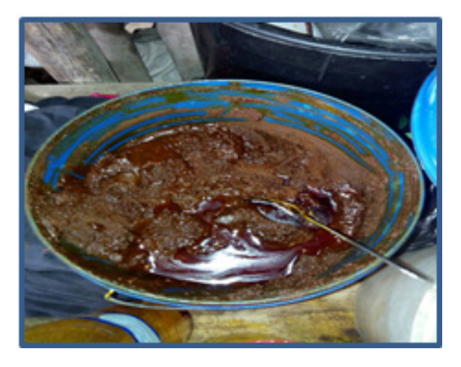
Figure 3. Pasty palm oil [7]

This oil (Figure 3) is obtained after decantation of the palm oil zomi. In the regions of Benin it is known and used by the population. It is commonly called Dja in Mahi and Becoun in Mina [7].