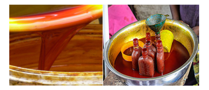
Figure 1. Standard" palm oil [10]

Its color varies from light orange to dark orange-red because of its high carotene content (Figure 1). Its name varies according to the sociolinguistic and sociocultural groups of Benin. We can mention: Amivè in Goungbe , Kolo in Adja , Ekpo kpikpa in Yoruba and Amivovo in Fongbe [9].