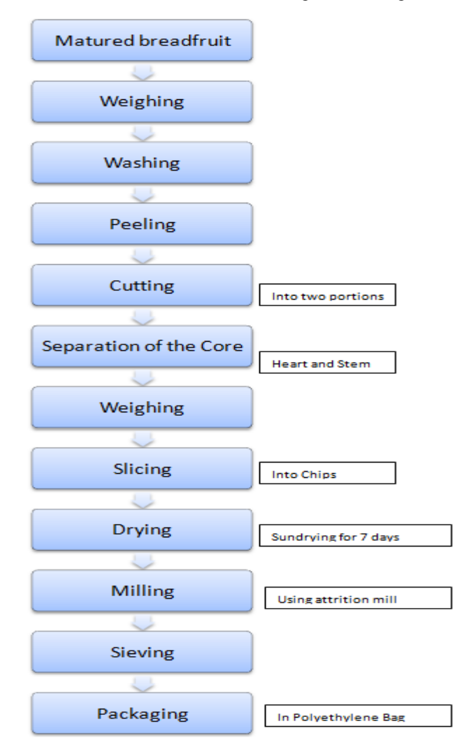
Figure 1. Process flow diagram for Breadfruit flour [22]

The materials used for this research include the freshly matured but unripe breadfruits ( Artocarpus altilis ) and was purchased from a farm in Ijebu-Emuren, Ogun State. Others materials include wheat ( Tristicum aestivum ) flour, granulated sugar, vanilla essence, margarine, eggs, baking powder, and powdered milk which were purchased from a local market called Sabo, Ikorodu, Lagos State, Nigeria.