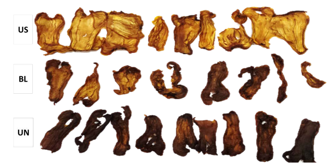
Figure 2. Color of dried cashew apple after different pretreatment conditions

Values are Mean \pm standard deviation (n = 3). Data in same column with different letters are significantly different (p<0.05).